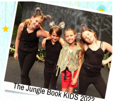
The Jungle Book KIDS 2022