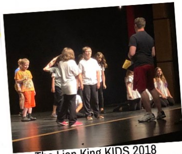
The Lion King KIDS 2018