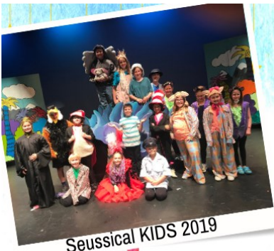
Seussical KIDS 2019